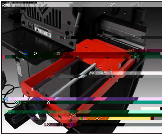
Press Brake Back Gauge